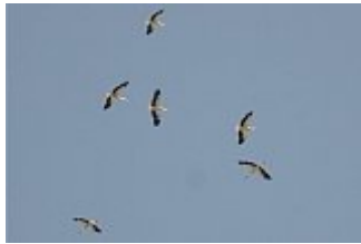
White Storks - 21 st August