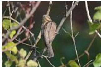
Wryneck - 24 th September