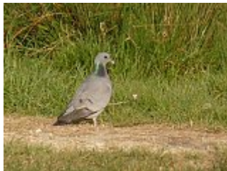
Stock Dove - 6 th May