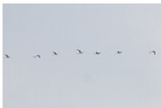
Great Egrets - 29 th October