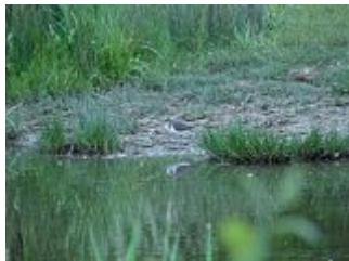
Common Sandpiper - 12 th May