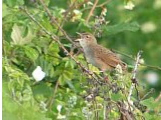
Grasshopper Warbler - 4 th May