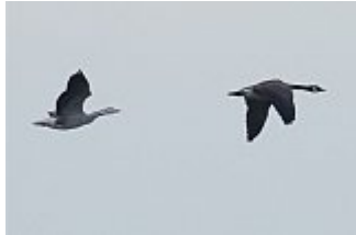
Bar-headed Goose - 7 th September