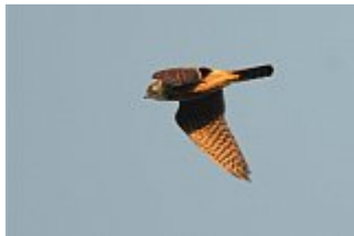
Merlin - 14 th September