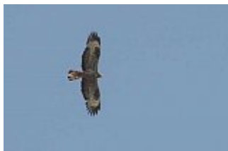
European Honey-buzzard - 31 st July