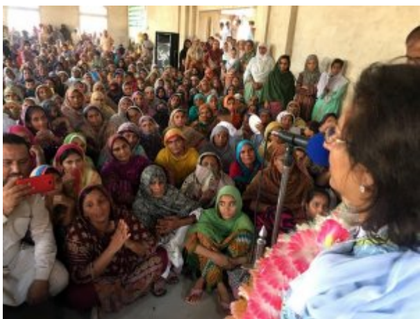
Asma Jehanghir addressing the meeting

He is now locked at the Pakistani “Guantánamo Bay detention center” the High Security Jail at Sahiwal, only under trail prisoner at the jail meant for convicted religious terrorists. He was in chain since March 2017 at the jail and it was removed only after Supreme Court order of removing the chains in September 2017. He lost almost half of his weight.