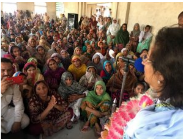
Asma Jehanghir addressing the meeting

He is now locked at the Pakistani “Guantánamo Bay detention center” the High Security Jail at Sahiwal, only under trail prisoner at the jail meant for convicted religious terrorists. He was in chain since March 2017 at the jail and it was removed only after Supreme Court order of removing the chains in September 2017. He lost almost half of his weight.