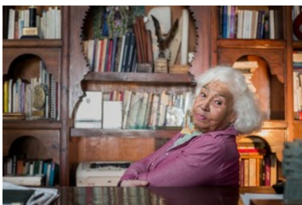
Nawal El Saadawi at home in 2015.

Although her autobiography A Daughter of Isis (1986) is among the best known of her publications world-wide, she identified her vocation as that of a novelist: "I am mainly a novelist. Most of my books are novels."