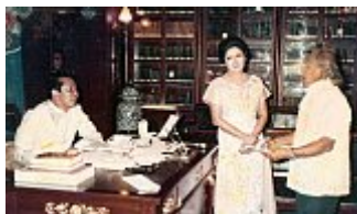
Climaco confronting President Ferdinand Marcos and his wife, Imelda

In the early years of martial law, when many people were silenced by the threat of harassment, detention, or death, Climaco was among the few who dared to openly resist Marcos' authoritarian rule.