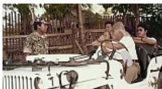
Climaco and his jeep

In Zamboanga City, Climaco intensified his crusade against the Marcos dictatorship. When a jeepney drivers' strike in Manila ended successfully with Marcos granting their demands, Climaco admiringly called the strikers "heroes" and called for the heightening of the mass civil disobedience movement. He urged the people to learn from the jeepney drivers and plan for a general strike to bring the country's activities to a full stop.