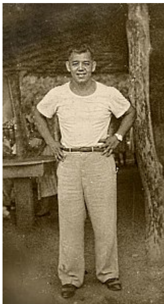
Mayor Climaco in the 50s

own jeep on frequent city inspection tours. Declaring that he already owned a house, Climaco refused to collect the monthly allowance he was entitled to. He also never used the official car assigned to him, preferring his own trustworthy old jeep.