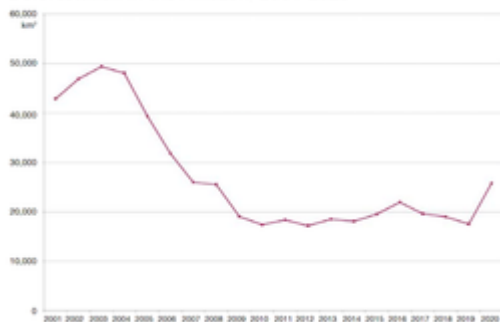
Deforestation in the Amazon, 2001-2020

Deforestation has surged since 2019, with the bulk of the impact in Brazil due to President Jair Bolsonaro's development approach resonating with loggers, ranchers and miners. RAISG