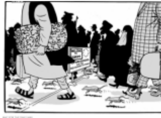
The Daily Mail , 2015.

As my colleague Lee Fang documented in 2015 [22], the prevailing rhetoric about Muslim refugees is identical to that used to demonize Jews during the World War II era. Indeed, the right-wing rag Daily Mail 's 2015 cartoon showing Muslim refugees as rats (top cartoon, below) perfectly tracked a 1939 cartoon in a Viennese newspaper depicting Jews the same way (bottom, below):