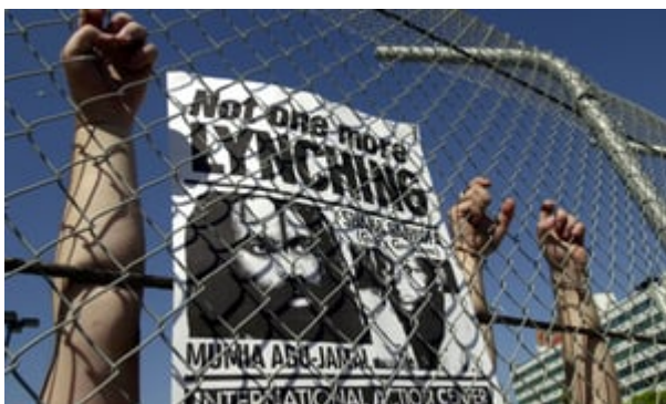
Demonstrators supporting Mumia Abu-Jamal in Los Angeles, California, in 2000.