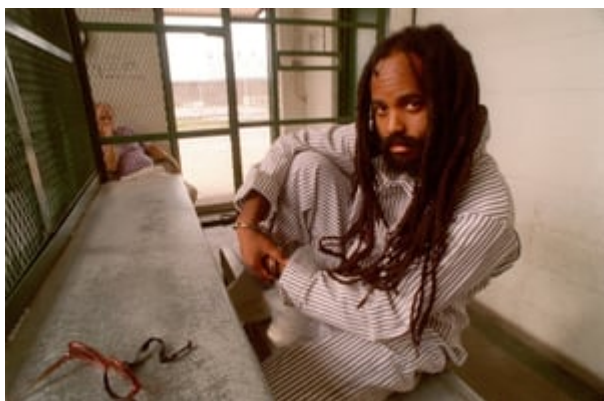
Former Black Panther Mumia Abu-Jamal.