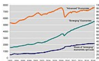
Graph 2. Global Industrial Production: Volumes (Billions of 2010 dollars)

This new form of globalization served as a way to escape from the crisis of the early 1980s, opening up a reservoir of low-wage labour, further increased after the collapse of “real socialism”. But it has led to a real shift in the global economy, as shown by the distribution of world manufacturing output (excluding energy): it has increased by 62 per cent between 2000 and 2018, but almost all of this growth was achieved by the so-called emerging countries, where it has more than doubled (+152 per cent), while it has increased only slightly in advanced countries (+16 per cent). Emerging countries represent today 42 per cent of world manufacturing output, compared with 27 per cent in 2000 (Chart 2) [3]. In some countries, such as China and South Korea, this industrialization is less and less confined to mass production industries (textiles, electronics) and represents an upward movement to high-tech products and even production goods.