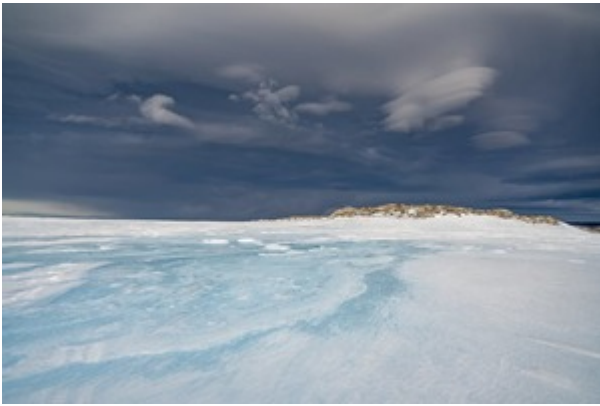
Recent storm clouds over East Antarctica.

Since it's autumn in Antarctica, temperatures in the continent's interior weren't high enough to melt glaciers and the ice cap. But that's not to say large swings in temperature didn't occur.