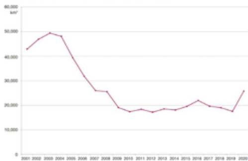
Deforestation in the Amazon, 2001-2020

Deforestation has surged since 2019, with the bulk of the impact in Brazil due to President Jair Bolsonaro's development approach resonating with loggers, ranchers and miners. RAISG