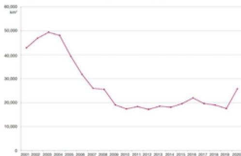
Deforestation in the Amazon, 2001-2020

Deforestation has surged since 2019, with the bulk of the impact in Brazil due to President Jair Bolsonaro's development approach resonating with loggers, ranchers and miners.