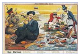
A contemporary Russian cartoon of the war.

In Politics , Aydin offers a rare global perspective on the various ways religious tradition and the experience of European colonialism interacted with Muslim and non-Muslim discontent concerning Western-dominated globalization, the international order and modernization. With a comparative focus on Ottoman pan-Islamic and Japanese pan-Asian visions of world order from the middle of the nineteenth century to the end of World War II, he offers a global-historical perspective on modern anti-Western critiques, Aydin gives full treatment to the Russo-Japanese War, but he concludes that the anti-Western movement in both countries started much earlier, with Christian-Islamic tensions in the case of Turkey and racial antagonisms in the case of Japan. In this strained atmosphere the Russo-Japanese War delivered a blow leading to the liberation of both societies. It empowered the claims of non-Western intellectuals in the debates about race, the Orient, and progress and provided the strongest evidence against the discourse of permanent and eternal superiority of the white race over the colored races.