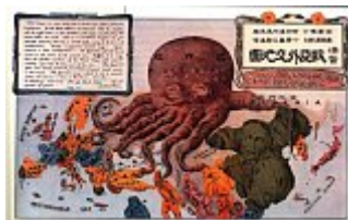
A Japanese propaganda map depicting Russia as the “black octopus”