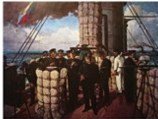
Painting of Admiral Togo on the Bridge of the Japanese Battleship Mikasa before the Battle of Tsushima in 1905