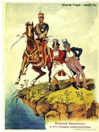
Emperor of Japan and his British and American well-wishers according to a Russian cartoon.

The contribution of E. Binder-Iijima in Sprotte on the “oriental question,” centering on the Balkans, also covers Turkey. The author attributes to the Russian defeat in 1905 the Bosnian Annexation Crisis of 1908/09, which anticipated the July Crisis of 1914 in many respects and can be viewed as the road to the First World War. At this time, the Tsar’s navy had its main base in the Black Sea, where it controlled its only fleet that still deserved the name. To reach the open sea, however, it had to pass through the Turkish straits. Meanwhile, Russia was defending the interests of Serbia on the issue of Bosnia-Herzegovina, controlled by Austria-Hungary. According to the treaty of Berlin, signed in 1878, Bosnia Herzegovina was still under Ottoman jurisdiction and the Young Turks’ revolution of 1908 reinforced the old constitution, which included this Austria-Hungarian controlled area. Russian aims concerning the straits, however, failed because of British opposition, and Russian approval of the annexation of Bosnia-Herzegovina by Austria-Hungary in 1908 was followed by a sharp protest from Serbia. In the end empty-handed, St. Petersburg experienced a “diplomatic Tsushima” (Binder-Iijima p. 13).