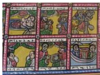
Comic style Ethiopian painting: King Solomon, the Queen of Sheba and their offspring Menelik

Emperor Haile Selassie clearly hoped to strengthen his prestige abroad by introducing constitutionalism and a parliamentary system, thereby securing the independence of his country. His reform policy following the Japanese model may be traced back to the admiration of his father, Ras (= Prince) Makonnen, the hero of Adua, who had looked up to the Tennō's empire after the victory over Russia proved that a non-European nation was equal to the West in culture and technology and could defy it.