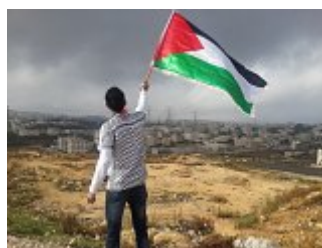
Palestine flag.

Chapters three and four are respectively about the Hindutva-Zionism kinship and on how pro-BJP/RSS/VHP diasporic groups in the US seek to emulate and align with the Zionist lobby there. Indian readers will be largely familiar with what is provided here about the evolution of Hindutva, the influence of Savarkar and European fascism, and the emergence of the Hindu Mahasabha and the RSS/Sangh Parivar. Within Zionism there were more diverse currents - a far-right revisionist current, a more socialist-inclined labour Zionism, a secular political current and a cultural-religious one. But agreement that the territory mandated to Palestine must be theirs meant ethnic cleansing to create a majority Jewish state became a further unifying imperative.