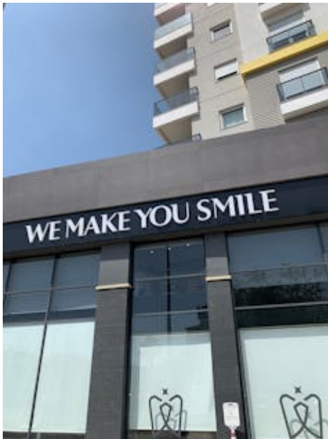
Dental clinic in Antalya, Turkey.

In Turkey, all the dentists I speak to (most of whom cater mainly for foreigners, including UK nationals) consider implants not a cosmetic or luxurious treatment, but a development in dentistry that gives patients who are able to have the procedure a much better quality of life. This procedure is not available on the NHS for most of the UK population, and the patients I meet in Turkey could not afford implants in private clinics back home.