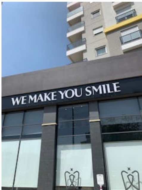
Dental clinic in Antalya, Turkey.

In Turkey, all the dentists I speak to (most of whom cater mainly for foreigners, including UK nationals) consider implants not a cosmetic or luxurious treatment, but a development in dentistry that gives patients who are able to have the procedure a much better quality of life. This procedure is not available on the NHS for most of the UK population, and the patients I meet in Turkey could not afford implants in private clinics back home.