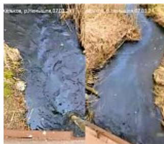
Poisoned rivers and springs of Kharkiv