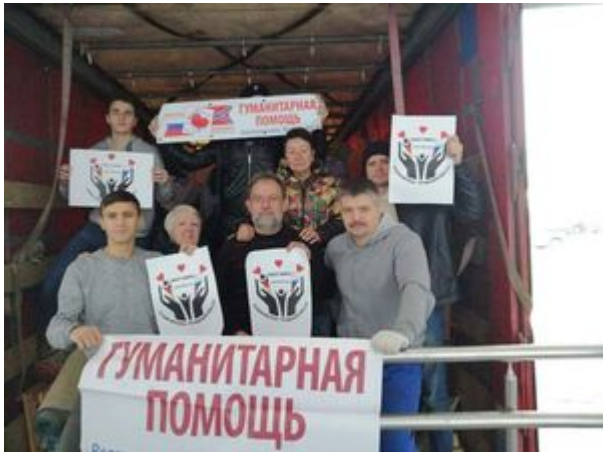
NCM members sending a truck to Donbass together with the Bridge of Peace Foundation VK.com

However, the involvement of an NCM member in the murder had no effect on the decision of the Bridge of Peace Foundation to cooperate with members of the movement. In the fall of that year, the National Conservatives, together with the Kilinc organization, again took part in the delivery of humanitarian aid to Donbass.