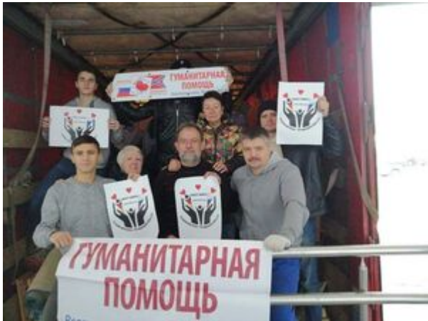
NCM members sending a truck to Donbass together with the Bridge of Peace Foundation

However, the involvement of an NCM member in the murder had no effect on the decision of the Bridge of Peace Foundation to cooperate with members of the movement. In the fall of that year, the National Conservatives, together with the Kilinc organization, again took part in the delivery of humanitarian aid to Donbass.