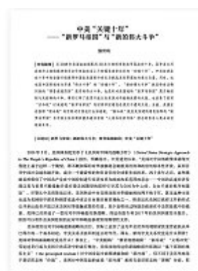
Jiang's 2020 article on China's "critical decade" ( Fudan )

Jiang describes Xi Jinping as leading a victorious struggle against American hegemony and the forces of capital within China, to return the nation to its socialist heritage.